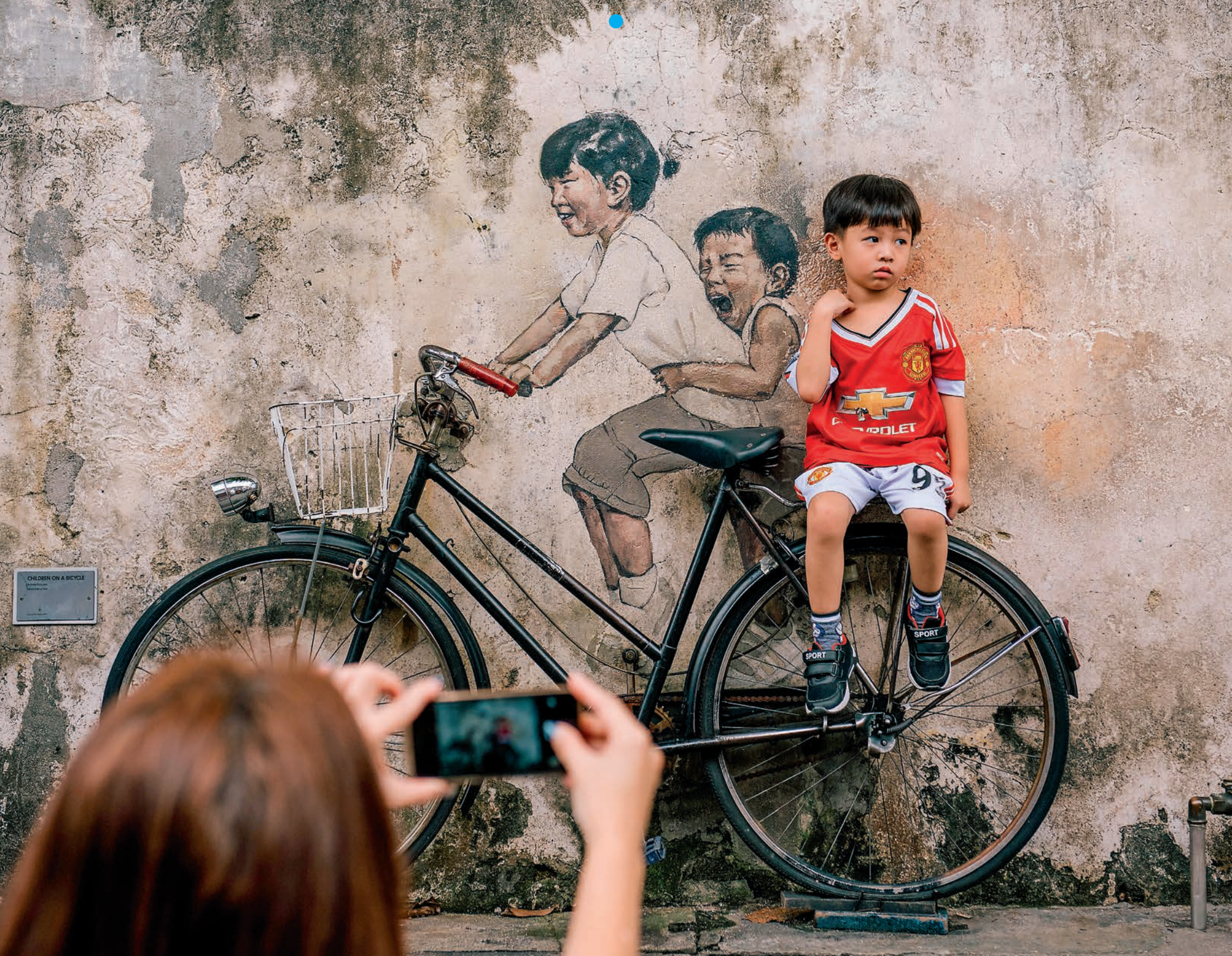
CHILDREN ON A BICYCLE